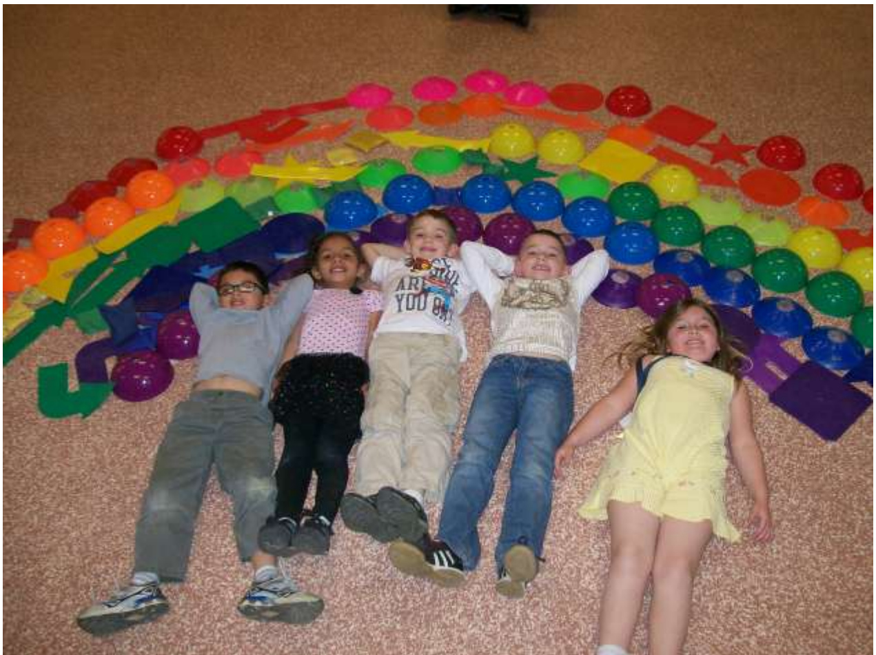
Look what we found at the end of the rainbow 😊

As many of you know our Fox room moves lock-stock and barrel to a larger Nursery School room in another part of the building to accommodate the larger amount of children we will have for the summer. We will be "moving" the week of June 4 th , so some of our time will be spent in the "big" room. We may also be spending more time outside doing fun things like lemonade and animal cracker walks or going for slushies. Be sure to check by our door for our location if you do not find us in our room. You will receive another newsletter with our schedule and a calendar when we start our summer session on June 14 th . I will be seeing most of you over the summer, but to those of you who will be leaving for the summer, be safe, have fun, and above all...make memories!!